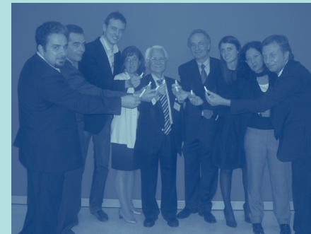
Kaizen Institute Italian team with Masaaki Imai.