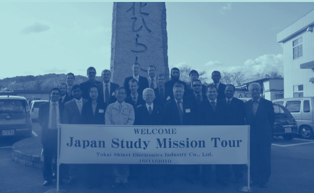
KAIZEN™ Benchmarking Tour to Japan.