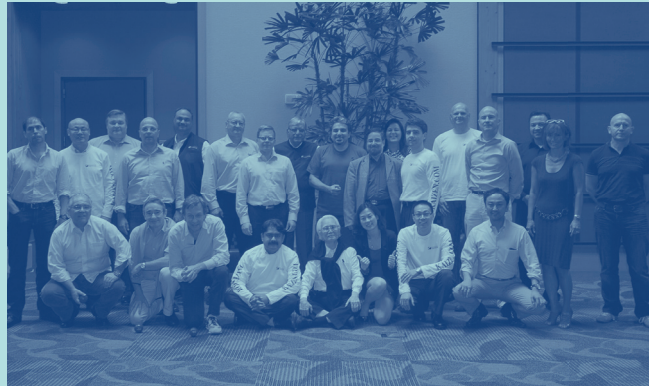
10th Annual Awards Event, Seattle, USA.