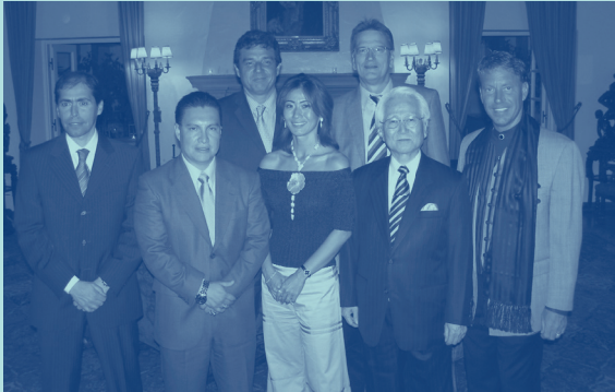
Early days of Kaizen Institute Consulting Group Global Operations, Global Leadership Council.