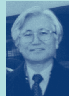
Founder, Masaaki Imai, in the 1980's as he established Kaizen Institute.