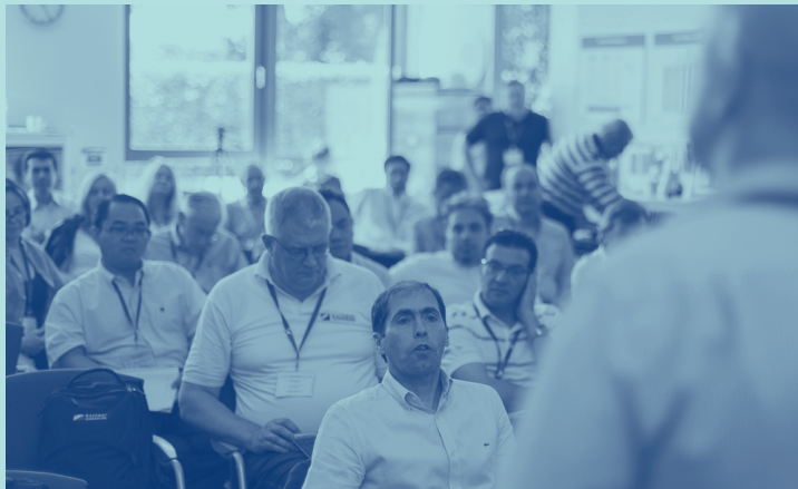
Business unit leaders from more than 30 countries joined the Annual Awards Event in Bad Homburg, Germany.