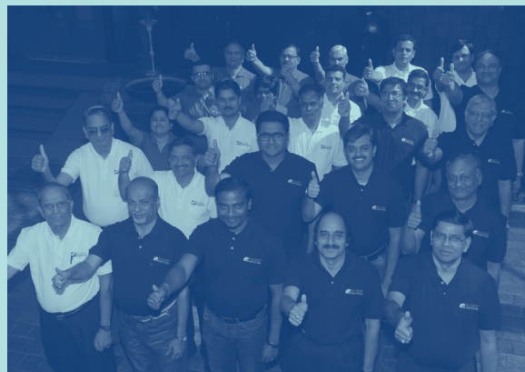
Consultant Meeting of Kaizen Institute India in Pune, India. More than 20 consultants attended the successful meeting.