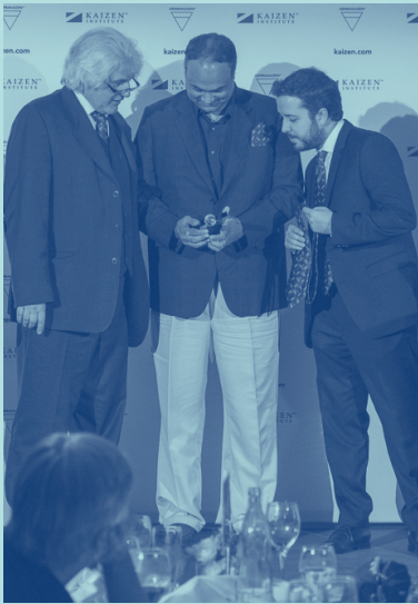
At the 12th Annual Awards Event in Bad Homburg, Germany, Kaizen Institute celebrated its most successful Business Units and consultants of the previous year during the gala evening.