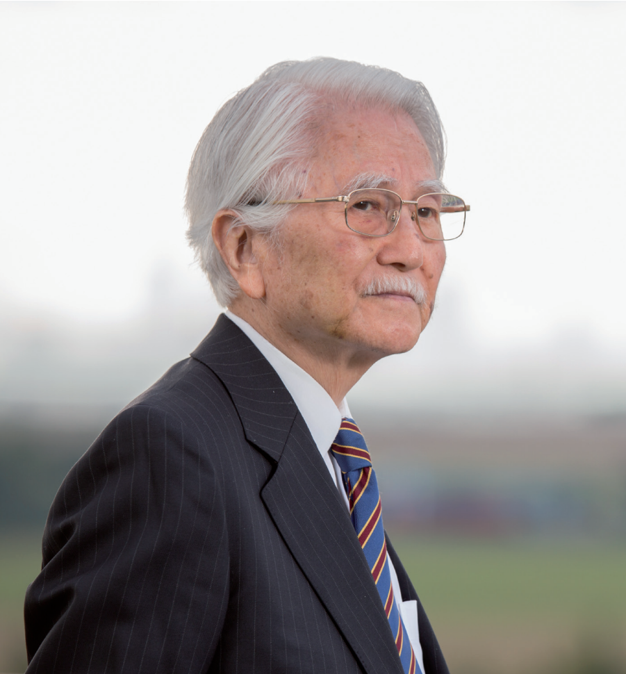
Masaaki Imai , Founder of Kaizen Institute